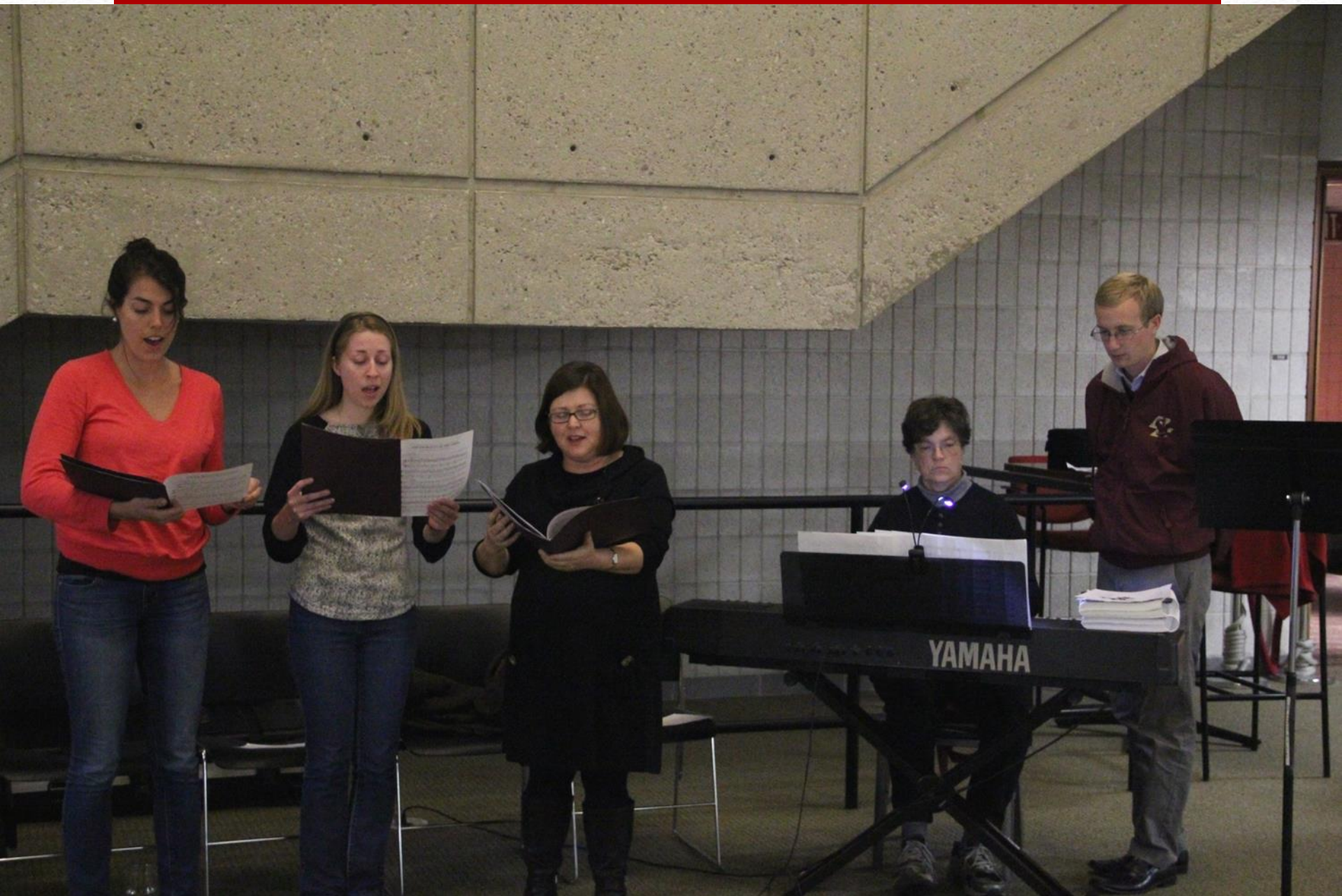
Music performed by STM Consort